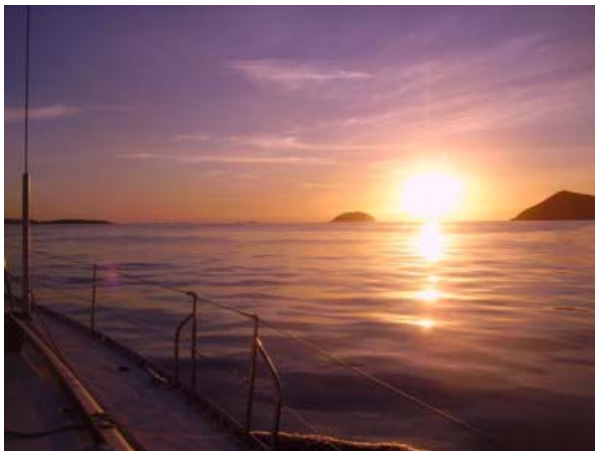
Sunset at Long Bay

One of the best parts of the BVI are some of the stunning sunsets seen from the bow of Mañana Maybe as she lays at anchor.