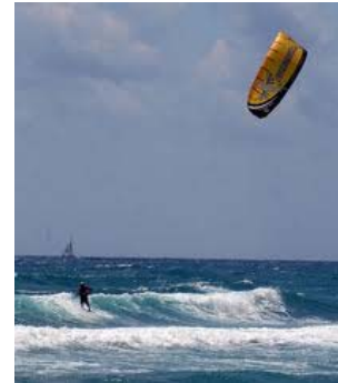
Kiting in the Surf

The absolute optimum way to enjoy this festive event is with your own chartered sail boat. A monohull or catamaran will be able to anchor close to the daily venue, serve as your transportation to the venues and of course it is the ideal floating hotel. Enjoy the daily parties until the wee hours of the morning and then just dingy back to your sail boat. Watch nature awaken as you enjoy an early morning breakfast on the cockpit of your boat. Seagulls diving for their breakfast, a turtle swimming by, bait fish are jumping. The air is about 86 degrees, skies are bright blue, small ripples