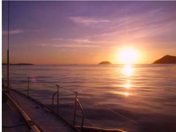
Sunset at Long Bay

One of the best parts of the BVI are some of the stunning sunsets seen from the bow of Mañana Maybe as she lays at anchor.