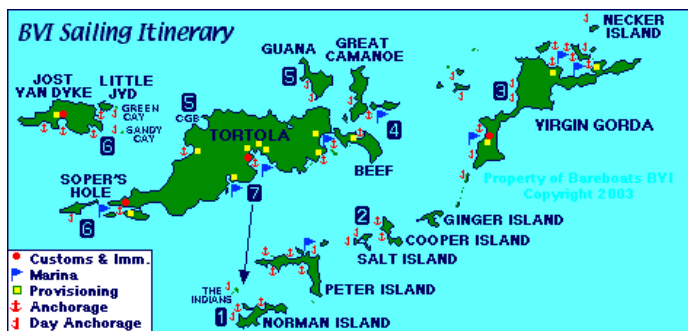
Map of British Virgin Islands

The BVI has 50+ beautiful islands and cays so close to each other you are always in sight of land. The chain of islands shaped like a necklace (see map above) offers numerous safe coves and protected anchorages. This sailing paradise offers daily choices in the type and distance of your sail. The BVI just 60 miles east of Puerto Rico provides the best sailing in the Caribbean with the trade winds consistently blowing 10 to 20 knots.