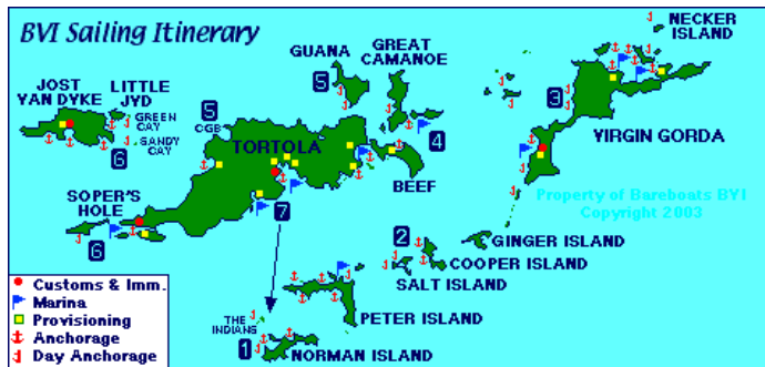
Map of British Virgin Islands

The BVI has 50+ beautiful islands and cays so close to each other you are always in sight of land. The chain of islands shaped like a necklace (see map above) offers numerous safe coves and protected anchorages. This sailing paradise offers daily choices in the type and distance of your sail. The BVI just 60 miles east of Puerto Rico provides the best sailing in the Caribbean with the trade winds consistently blowing 10 to 20 knots.